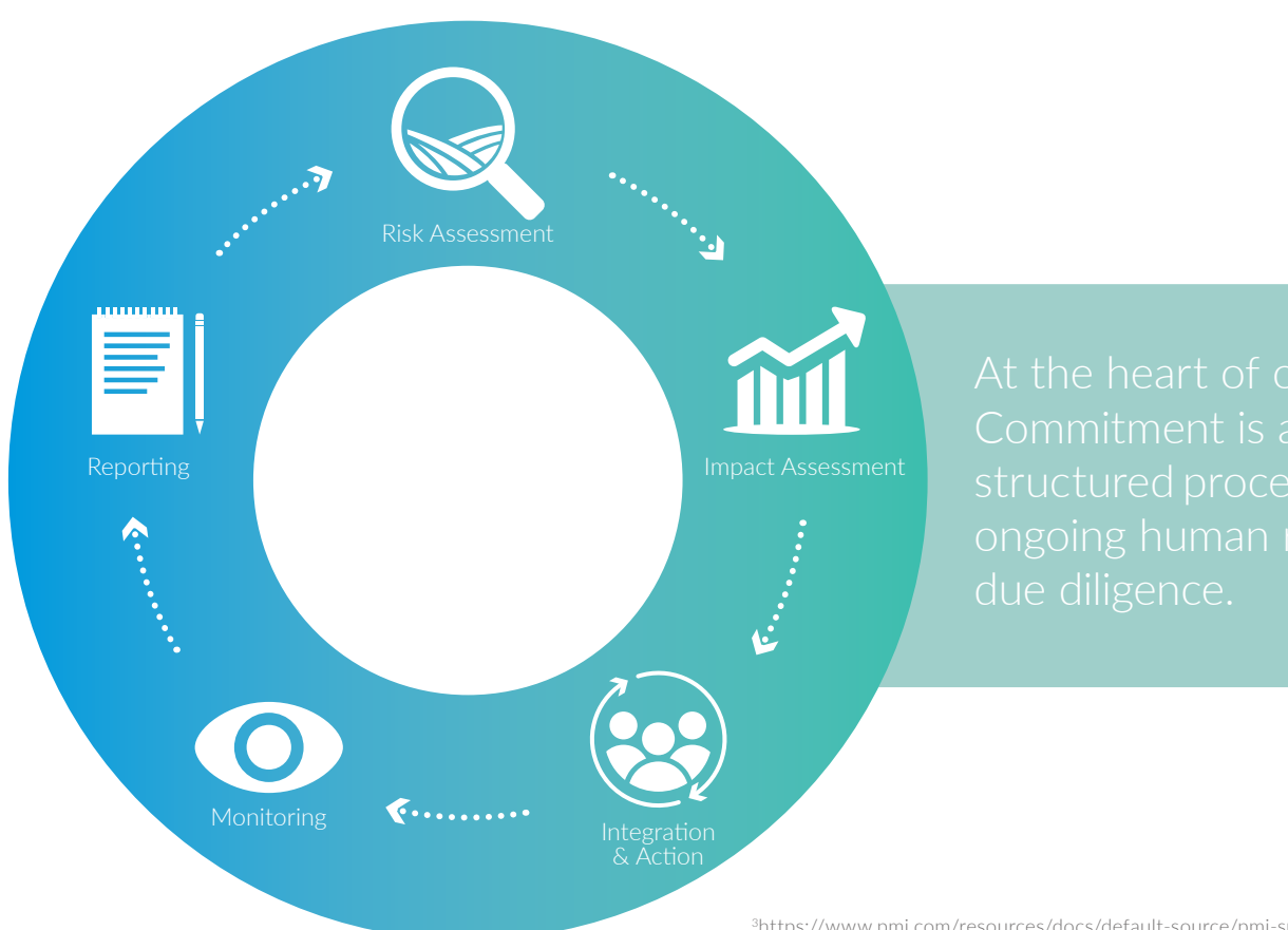
Figure 1: PMI's human rights due diligence process

<sup>3</sup>https://www.pmi.com/resources/docs/default-source/pmi-sustainability/pmi_ sustainability_report_2016.pdf?sfvrsn=143382b5_2